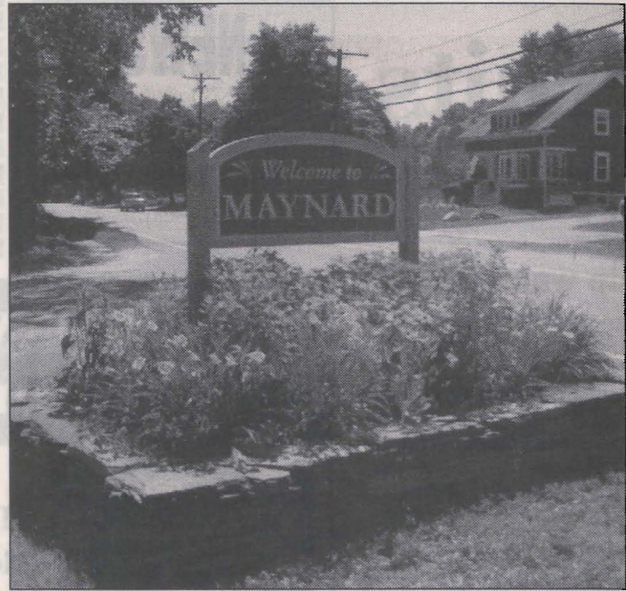
A Maynard Community Gardeners’ planting welcoming people to Maynard.