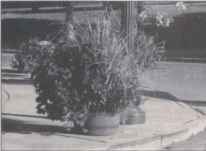
A MGC maintained bucket in downtown Maynard.

Gardeners, visit online at MaynardGardeners.org , or stop by their table at the Farmers’ Market, every Saturday from 9 a.m. to 1 p.m. at Clocktower Place starting June 26.