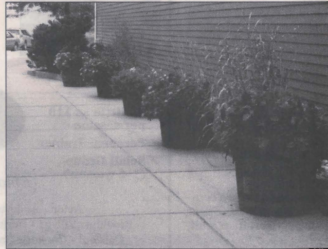
Maynard Community Gardener’s plantings in the alley next to the Outdoor Store in downtown Maynard.